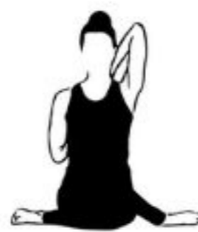
Cow Face Pose Gomukhasana