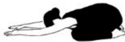
Extended Child's Pose Uthita Balasana