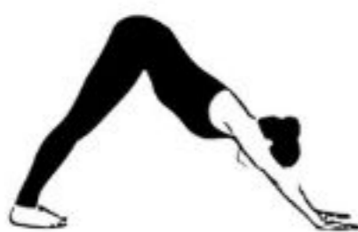
Downward-Facing Dog Adho Mukha Svanasana