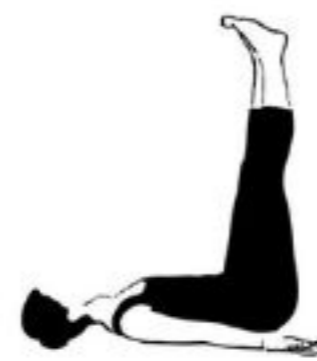
Legs Up The Wall Viparita Karani