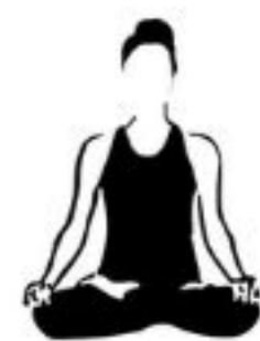
Lotus Pose Padmasana